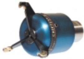
Grippex Bar Puller