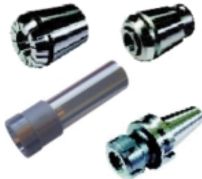
and a wide range of other products

We provide complete turnkey solutions for both Machining and Turning centre Applications